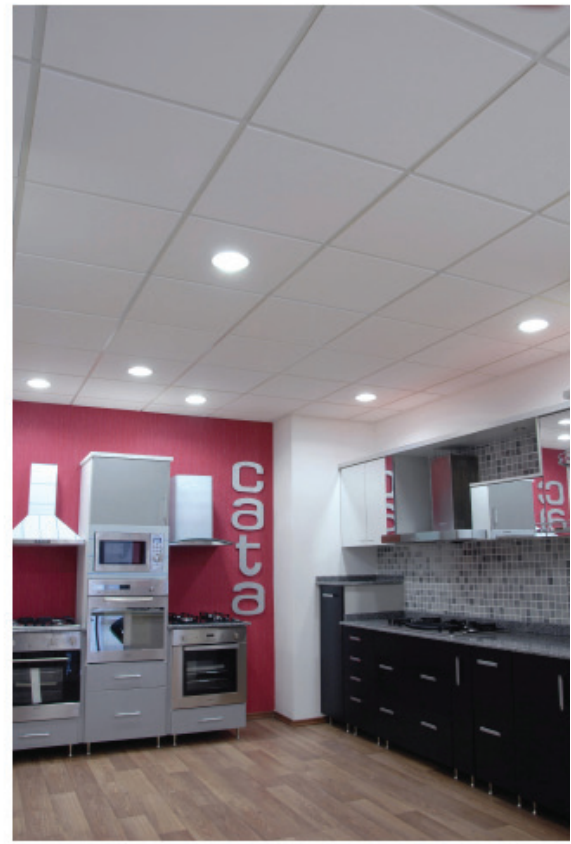
Karakuş Mutfak - Adana

Perform installation of Parmephon Advance ceiling tiles as late as possible during the building stage. They are installed on 15 mm or 24 mm grid system. To minimize contamination, use clean cotton gloves during installation or any handling of the tiles.