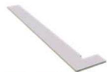
4) Installation gauge