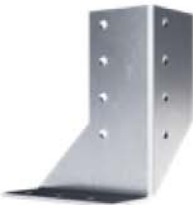
6) Bearing bracket